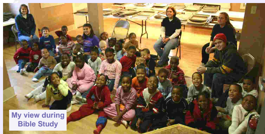
My view during Bible Study