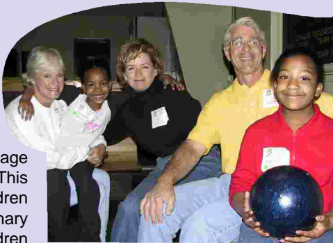
A few bowlers at our last Fun Bowl

For the sixth year in a row, Cottage Cove will be hosting its' Fun Bowl. This event is both a field trip for the children of Cottage Cove and one of our primary fundraisers each year. The children that have participated in this outing in the past are quick to speak of how much they enjoy Fun Bowl. They not only speak about the actual bowling activity, but also of the "nice people" that came to bowl with them.